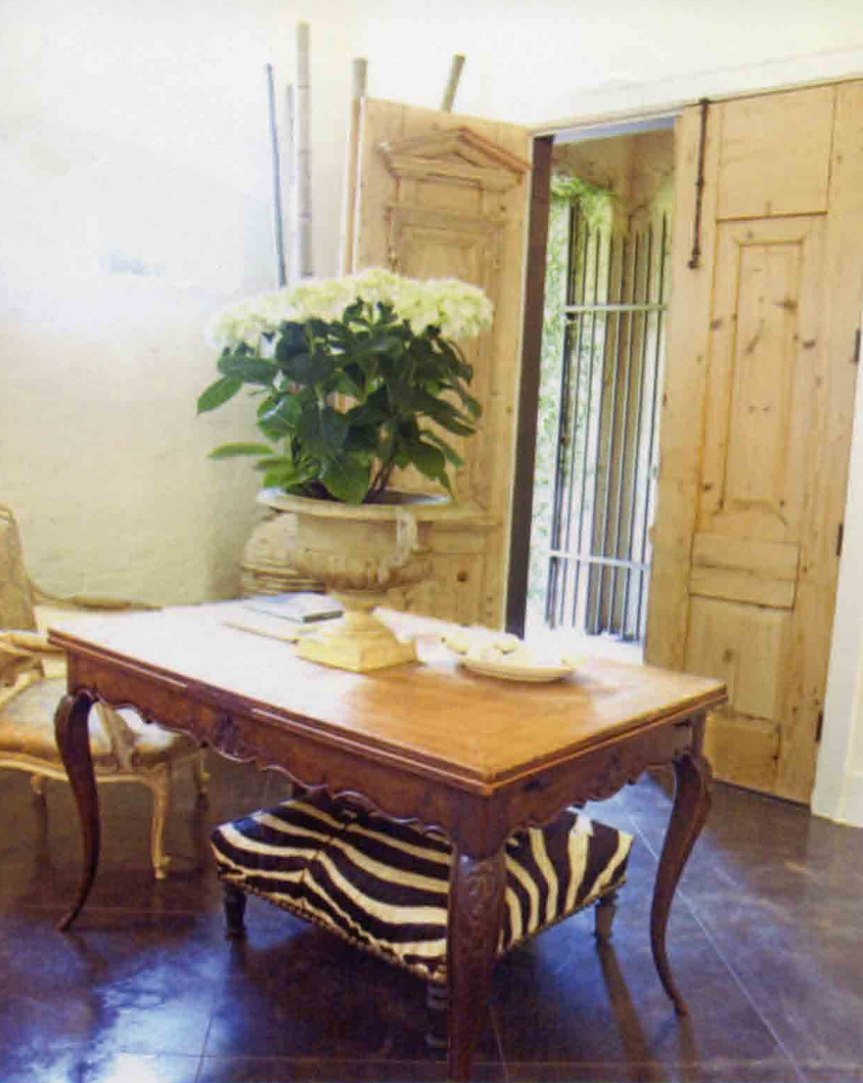
Atchison Imports warehouse is filled with vignettes of room settings giving decorators and homeowners a multitude of great ideas.