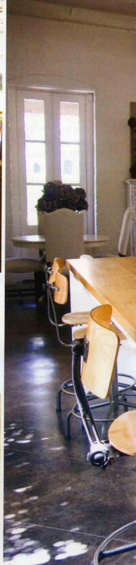
The stylish and highly functional kitchen was outfitted by Mobile Appliance.